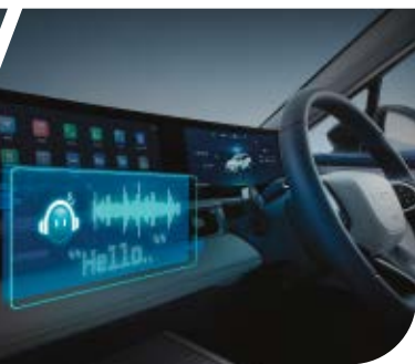
Intelligent Voice Assistant