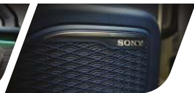
Sony B Speakers