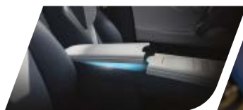
Front Armrest with Cooling System