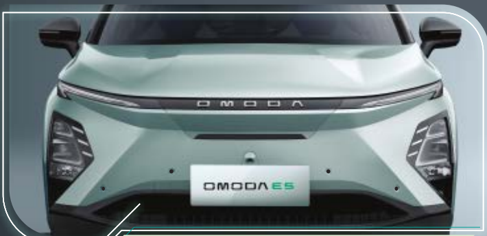
X Future Tech Front