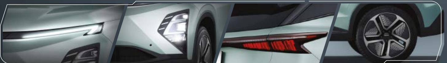
LED Daytime Running Lamp (DRL)