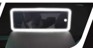
Futuristic Sunvisor with New Tech-Light System