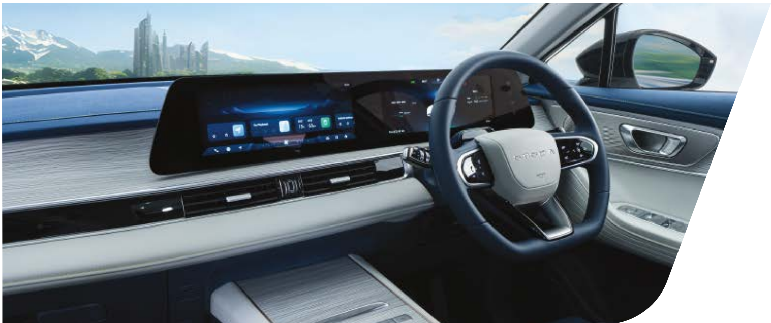
Futuristic Cabin with 24.6 inch Super Large Curved Screen