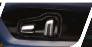
Driver and Passenger Electric Seat Adjuster