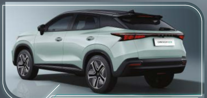
Light & Shadow Cutting Streamlined Body