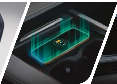
50w Wireless Charger with Cooling System