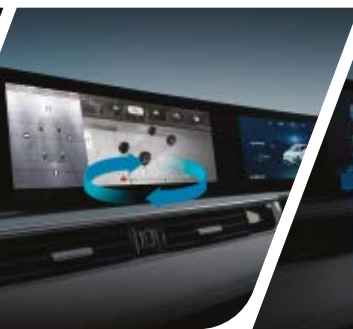
540° HD Panoramic Camera