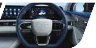
Multi-Function Steering Wheel