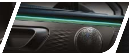
64 Multi-Colours Ambient Lights