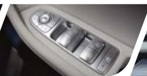
Power All Window