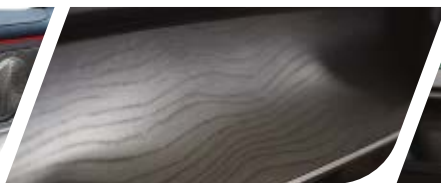
Special Wood Panel Dashboard