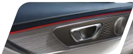
Multi-Colour Interior with Soft Touch Material