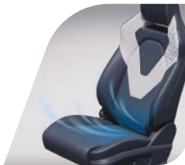
Driver & Passenger Ventilated Seat