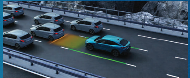
Driver assistance systems enhance comfort and sense of calm when driving