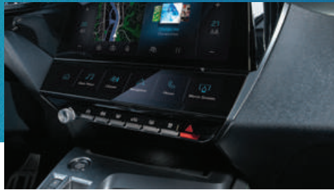
New configurable PEUGEOT i-Toggles to give quick and intuitive access