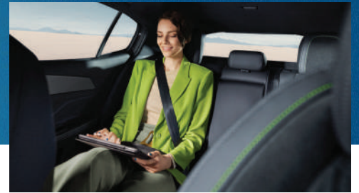
Top of the range comfort for driver and passenger