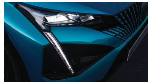
The front lights simulate lion fangs