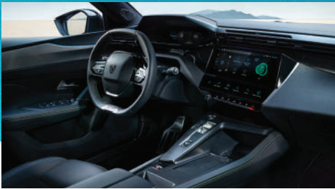
The latest generation PEUGEOT 3D i-Cockpit® with new design and technology