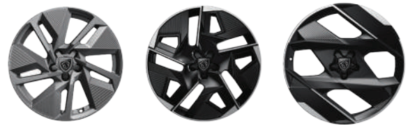
18" Granite Grey 18" Granite Black 20" Monolithe Black