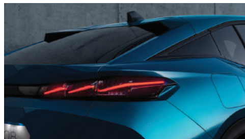
The rear light cluster simulates 3 lion claws